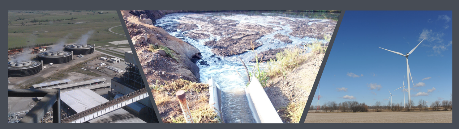
1: Sampling and on-site analysis on a 700-foot stack in Kansas to verify the effectiveness of activated carbon injection along with chemical addition to control mercury emissions.

CEC's biological monitoring services support 401/404 permit applications, reducing the need to hire additional consultants. A leader in field investigations for threatened and endangered species, CEC is known for having highly knowledgeable, federally permitted U.S. Fish & Wildlife Service-approved surveyors.